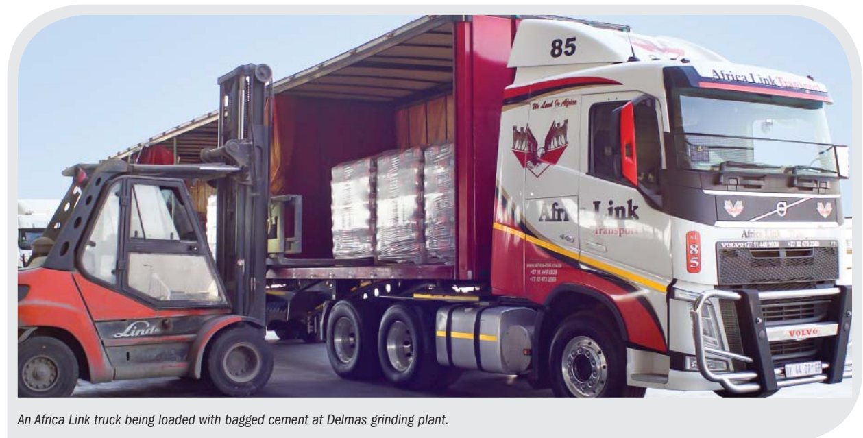
An Africa Link truck being loaded with bagged cement at Delmas grinding plant.

"No one can force you to do what you don't want to do. You need to be self-motivated and to do your best," concluded Sunshine.