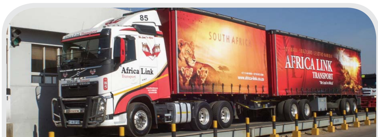
Africa Link truck collecting bagged cement from Delmas grinding plant.