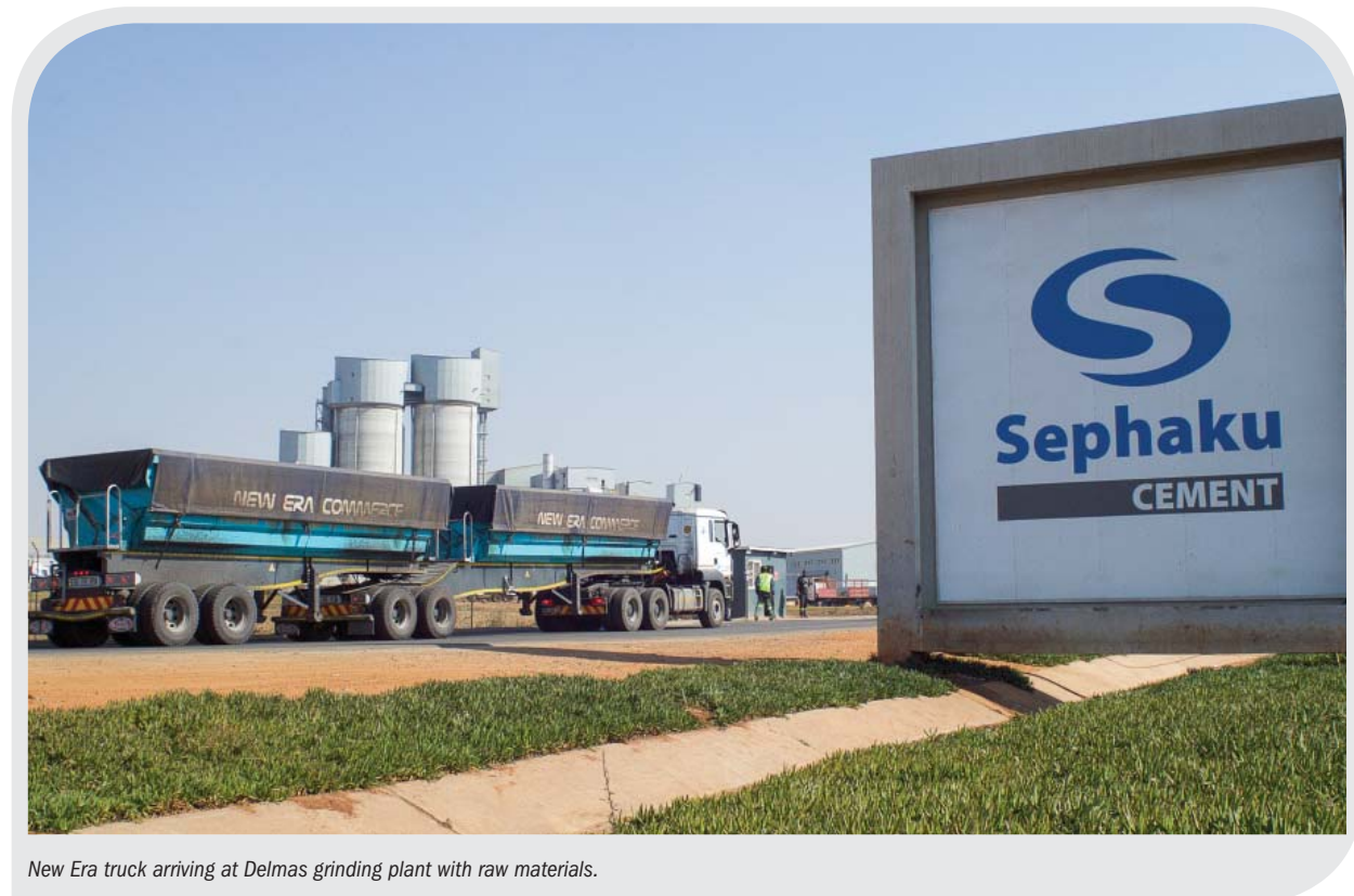
New Era truck arriving at Delmas grinding plant with raw materials.